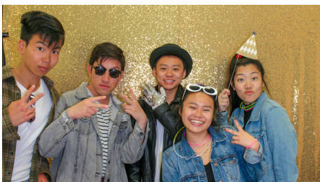
There was also a photo booth with costumes for everyone to use.