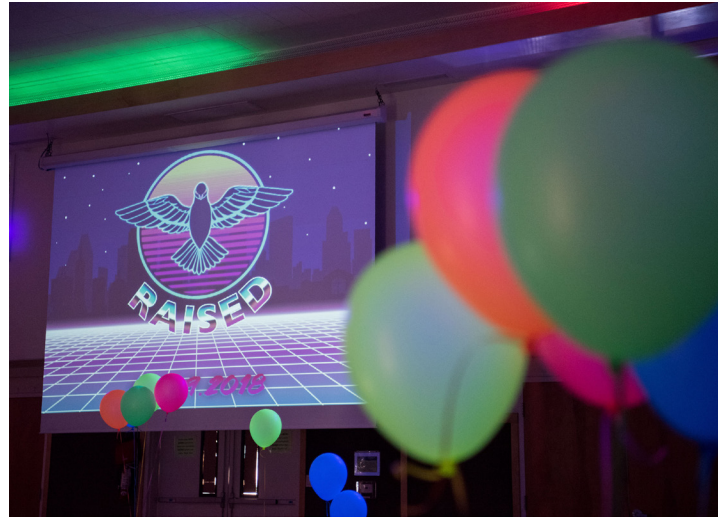
The theme for the 2017-2018 school year was Raised. For the banquet, the students went with an 80s theme.