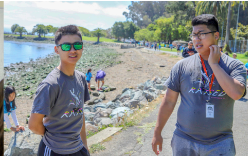
Daniel aka Sandman (Rise of the Guardians)

1 week as a camper at Ocean View, 2 years as counselor, and 2 years as Chief.