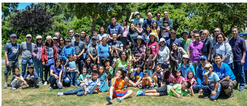
The Joyful Fellowship family picnic.

感謝主的恩典，帶領我們來到喜樂團契這年輕家庭的羣體中。在喜樂團契不覺也有三個年頭，記得那時和丈夫一人拖一個小孩參加聚會，沒有一個人認識，就這樣開始我們每兩星期一次的團契生活。曾經有個弟兄分享一句名言，「撫養孩童是需要整個村落」。弟兄姊妹一起敬拜查經，彼此認罪、互相代求，在真道上彼此建立，在教養兒女的功課上互相激勵。