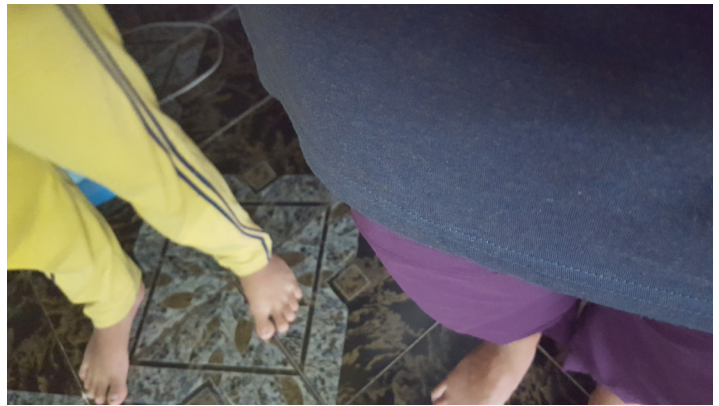
"She just needed to stand there and so there we stood in silence watching everything around us"

After about five minutes, she took a step forward and turned towards me. She looked at my shirt and pointed at the Cross in the middle and I said "yes, that's the Cross" and I wondered what was going through her mind but I didn't have to wonder long as she held her arms out and began to motion being bound to the cross. "YES," I exclaimed, "YES! Jesus died on the cross. Jesus died on the cross for YOU." Keep in mind that she didn't really speak English and I certainly do not know how to speak Khmer. She then pointed at the Khmer script on my shirt and I said "YES! Jesus loves you! It says Jesus loves you." She then pointed at my toes and made a painting motion and I sheepishly said "Yeah, my nails are painted. Purple is my favorite color." She then cupped her hands around her mouth and leaned over and whispered things to me. She'd look at me for a reaction and then laugh and so I would laugh. I know I will never know what she said that day but I know that I will never forget our conversation.