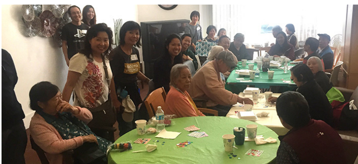
Our Sunset Team enjoyed interacting and playing bingo with the Cantonese speaking seniors at one of the Tenderloin buildings.