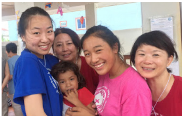
The younger children love to be held and play with our team.

"I am thankful to have this opportunity to join Cambodia STM. It was a blessing to have close contacts with the Pleroma school kids and the Village kids. It was a joy to see how happy and willing they wanted to learn and receive Christ.