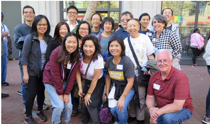
Over thirty Sunset Church volunteers participated in the 2017 City Impact Conference to worship and serve the Tenderloin residents.