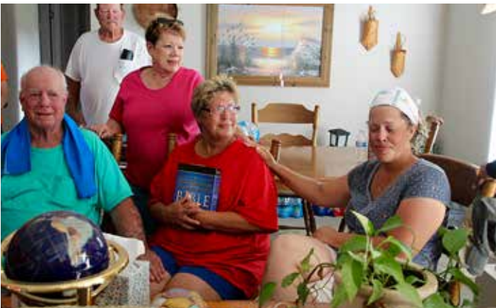
Home owners with their Bibles from Samaritan's Purse.