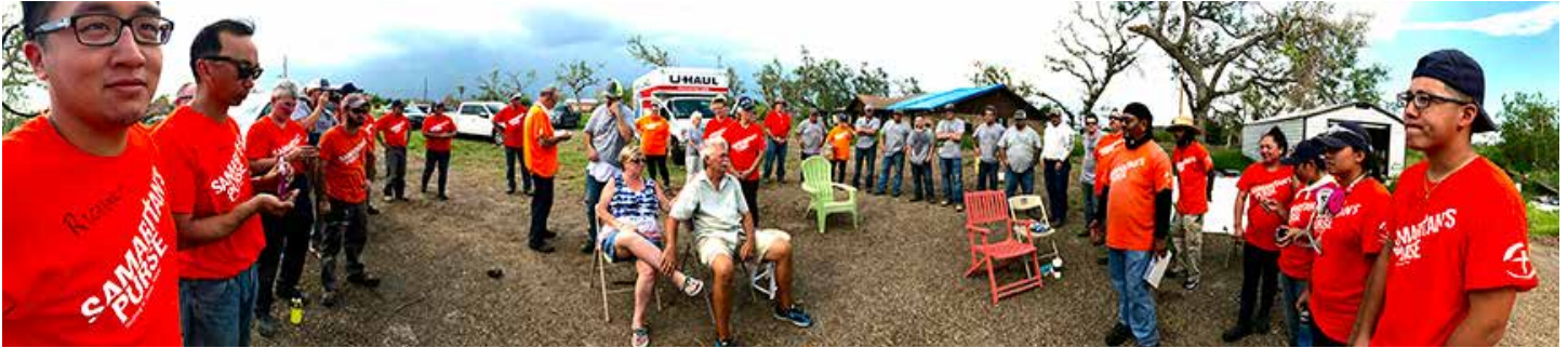
After completing a house, Samaritan's Purse gives a Bible signed by everyone who helped on the house to the homeowners.