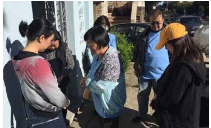
Praying with one of the families that received help.