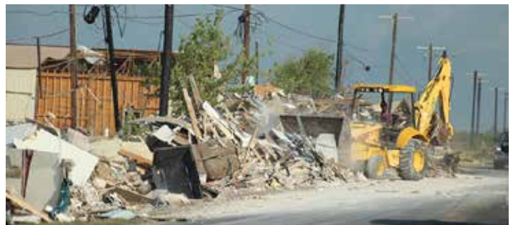
Some of the destruction in Texas.

The other thing that amazed me was that even though our skills were limited how much we were able to help and be a blessing to the homeowners we served. On our third day, we went to a house that was completely flooded up to two feet of water. Most of the house and its contents had water damage and was in disarray. There were holes in the roof. A huge tree had been uprooted and was leaning on the house. While talking to the homeowners, we could feel their sense of despair and of being overwhelmed. My personal feeling was that it would take a month to clean up the house. We joined with other teams and individuals from across the country and in three days, we were able to: 1) cut the tree down, 2) tarp the roof so that it ►