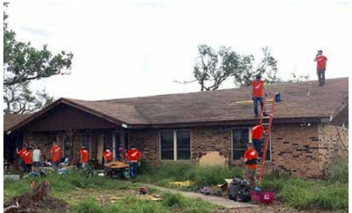
The team beginning to work on a house.