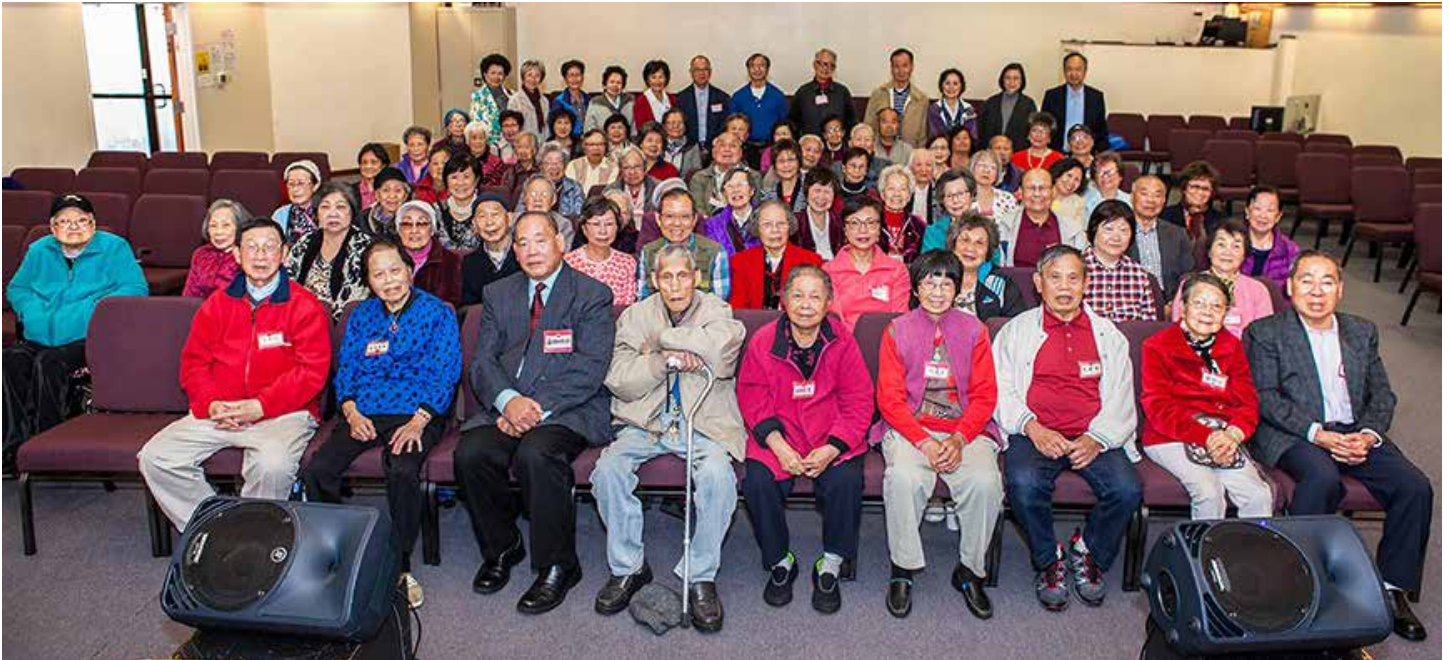
The Yut Hong Fellowship at the 26th Anniversary.