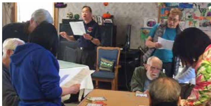
The team sang "Amazing Grace" and "I will Sing of the Mercies of the Lord" with the Kindred residents.