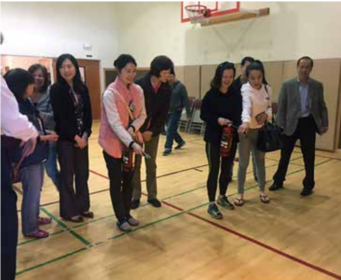
Participants were able to practice using a virtual fire extinguisher.