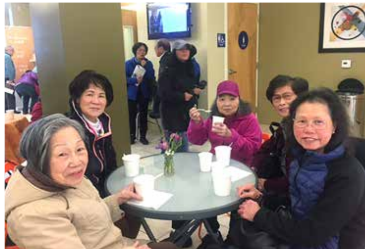
Enjoying some good chicken jook! 享用美味的雞粥!