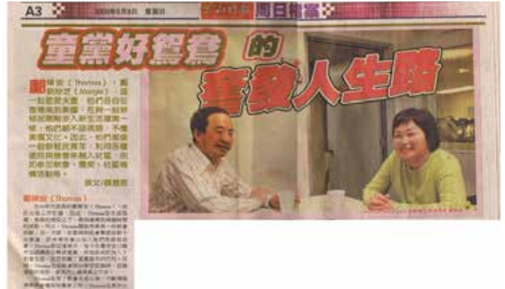
Interviewed by a SF Chinese newspaper in 2005. 05年金山時報訪問

"This is how one should regard us, as servants of Christ and stewards of the mysteries of God. Moreover, it is required of stewards that they be found faithful." ■