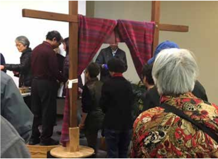
Members of the Cantonese congregation were able to experience what it was like walking through the torn veil.