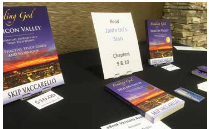
A book featuring different Christians in Silicon Valley.